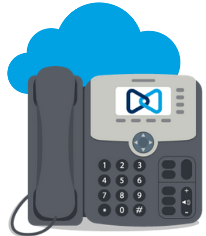
Mitel Connect CLOUD Fully hosted UCaaS