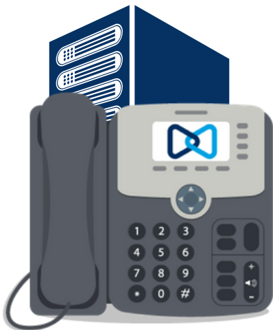
Mitel Connect ONSITE Owner maintains and controls the system