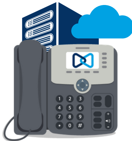
Mitel Connect HYBRID Combines cloud and onsite deployment features